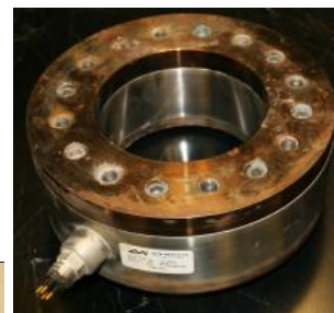
DeltaMetrics Load Cell