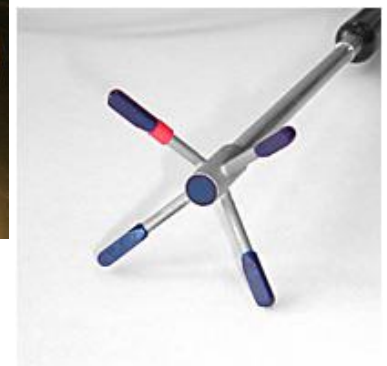
ADV 3D probehead